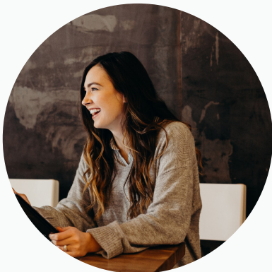
Live Classes & Online Interaction

Experience a dynamic and engaging environment that inspires and challenges you to think critically. Become a world-class General Manager through hands-on learning, collaboration, and interaction with experts in the field.