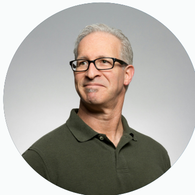
Top Faculty from XLRI