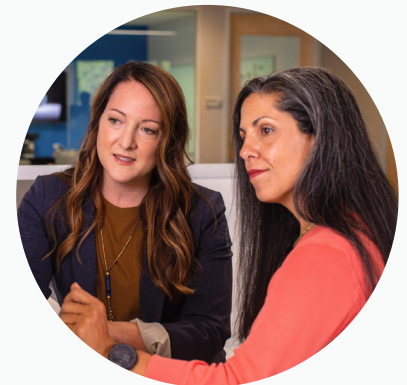
Lifetime Access to Study Material